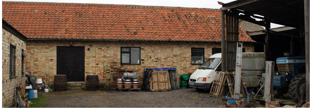
Hill Farm, Shelford Road, Fulbourn, Cambridgeshire. CB21 5EQ 07906 066794